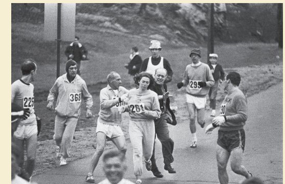
1967年參與波士頓馬拉松比賽受阻的 Kathrine Switzer Kathrine Switzer, interrupted in the 1967 Boston Marathon

In the 1967 Boston Marathon, Kathrine Switzer registered with a gender-neutral name and entered the race officially. She, a woman, participated in a marathon exclusive to men. Halfway in the race, a male race official tried to interfere and have her removed, but Switzer managed to complete the race.