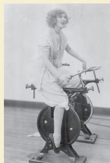
1920年代在室內運動的女人 Women exercising indoors in the 1920s

直至今日，對於女性運動而言，在身體、服裝跟空間這三個生活層面上，都走過了封閉到開放的年代，女人由追求纖細體態、包得緊緊的室內運動，走向陽光開放更加女性友善的多元運動項目。