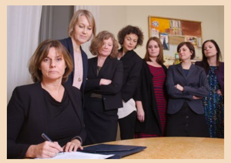
Minister for International Development Cooperation and Climate Isabella Lövin signes the Government proposal for a new Climate Act